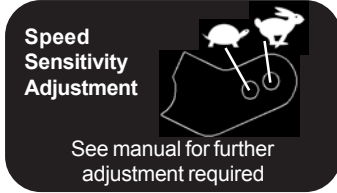
Figure: Decal on side of Control Console

The controls are initially set with the Speed/Sensitivity Adjustment in the slower, less sensitive position. After becoming completely familiar with mower operation the operator may desire to increase