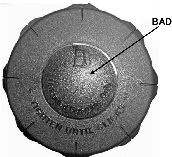
Defective Cap – Has fuel pump and text "Unleaded Gasoline Only" on dome

Procedure: File normal on-line warranty claim, .2 hr allowed per unit. Type 45410002 as part failed and for part replaced. Return defective caps back to your distributor using the WMI UPS account. (Ref Bull 83C) Distributors are to return caps to WMI when batches of ten or more are received.